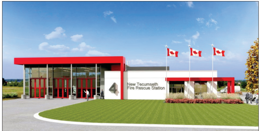
FUTURE SERVICES – The Town of New Tecumseth recently celebrated a milestone in the construction of a new fire station. The fire station will help to bring more modern services to the community.

Fire Station 4 will contribute to reduced emergency response times, improved service coverage in high-growth areas, and the continued delivery of reliable fire prevention and emergency response services. The construction of this facility represents a strategic investment in public safety to support the Town's continued growth and future needs.