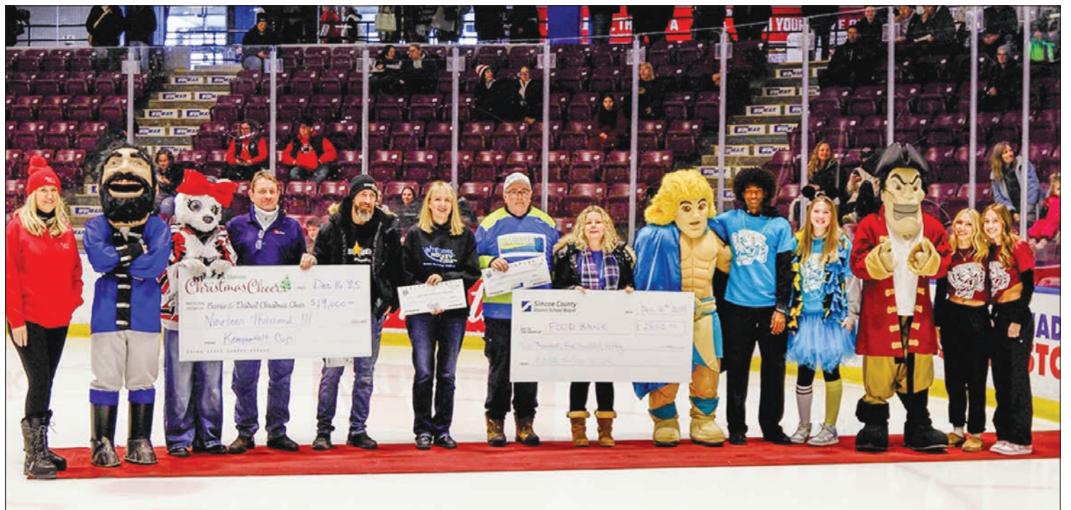
SPORTS FUNDRAISER – for some on-ice fun. The tournament was held at the Sadlon Arena in Barrie on Dec. 16-17. The tournament raises funds for several local charities.

as well as all of the staff and students who supported and participated in these events.