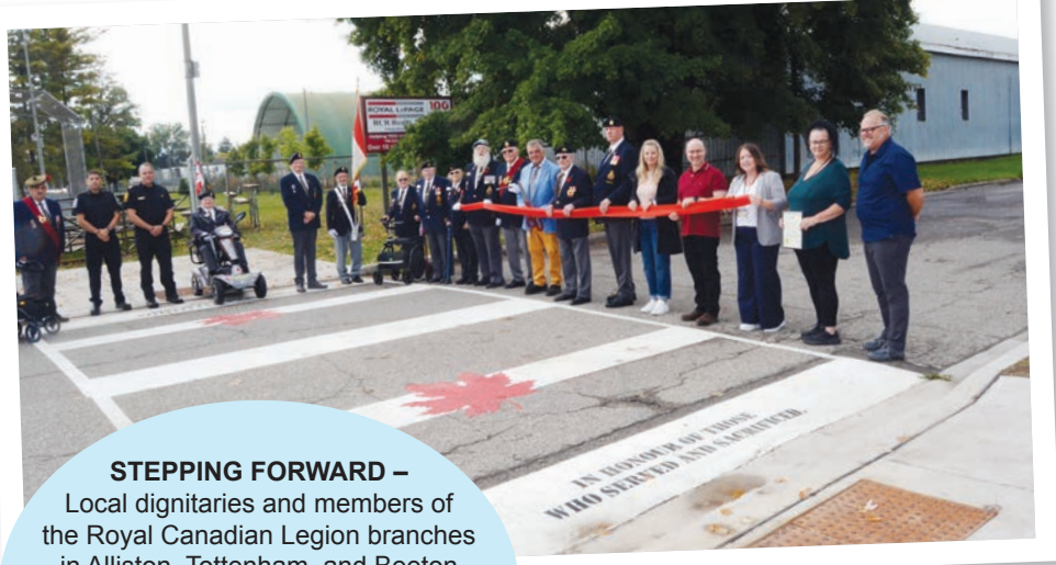
STEPPING FORWARD – Local dignitaries and members of the Royal Canadian Legion branches in Alliston, Tottenham, and Beeton gathered to officially open a new crosswalk dedicated to veterans on Albert St. Just outside of the Town of New Tecumseth administration building on Monday, Sept. 22.

• Candidates respond to issues prior to provincial election: There are five candidates running in the upcoming provincial election for Simcoe Grey, scheduled for Feb. 27. The New Tecumseth Times offered each candidate the opportunity to address constituents on several important issues.