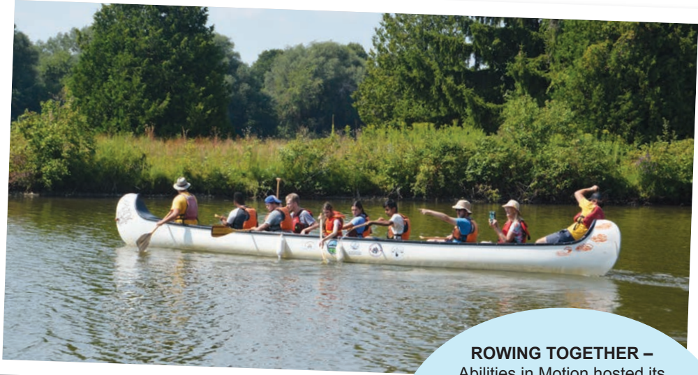
ROWING TOGETHER – Abilities in Motion hosted its fourth annual Regatta at Earl Rowe Provincial Park on Friday, Aug. 15, and Saturday, Aug. 16. The big canoe is always a favourite for visitors. The 26-foot canoe allows several people to go out on the water together.

• New Tecumseth placed into new riding for federal election: The riding of Simcoe-Grey has had its boundaries changed and will now include Mulmur Township and Grey Highlands. Some residents of Adjala-Tosorontio will find themselves voting in the Dufferin Caledon Riding. The Town of New Tecumseth will now join Bradford West Gwillimbury in the new riding of New Tecumseth-Bradford.