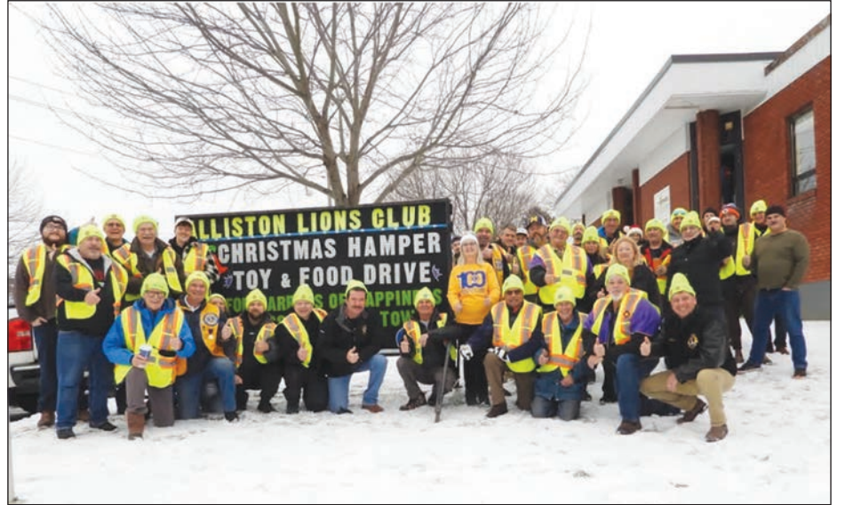
FEEDING THE COMMUNITY: The Alliston Lions Club wrapped up its annual 2025 Food and Toy Hamper campaign and made deliveries to deserving families in the region on Saturday, Dec. 20, and Sunday, Dec. 21. The Lions brightened the Christmas season for 192 families and over 250 children. Alliston Lions, family members, and friends who helped with the campaign gathered at the Lions Club in Alliston after the deliveries were completed.

I wish all of you, and especially those in our respective "communities of care," a very warm and wonderful holiday season and a happy and healthy New Year!