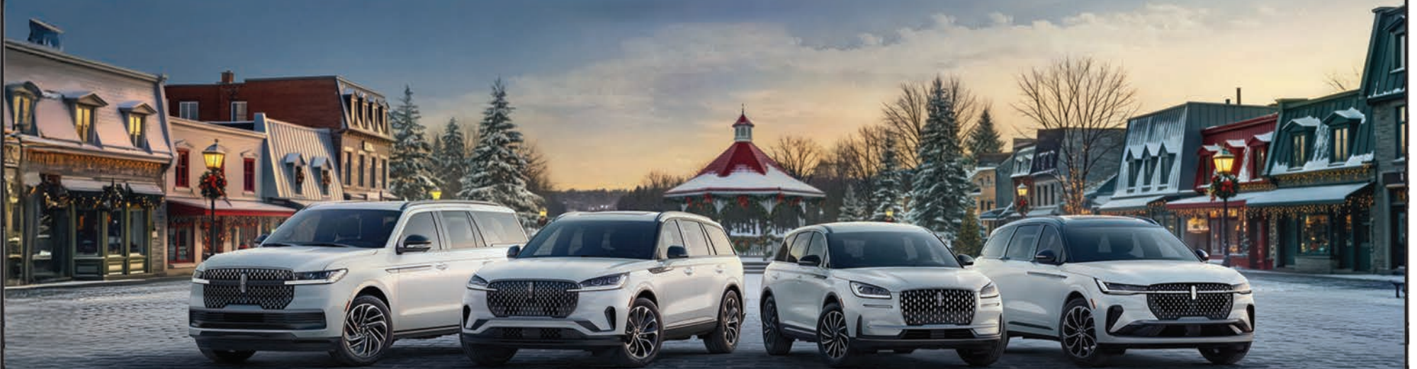
NAVIGATOR | AVIATOR | CORSAIR | NAUTILUS